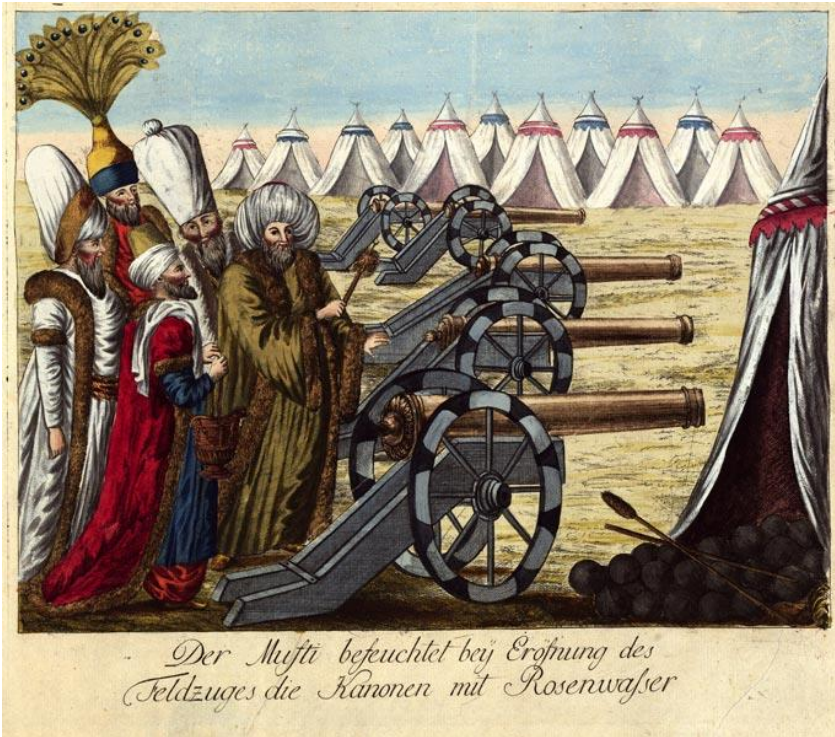
Ottoman Army artillerymen 1788