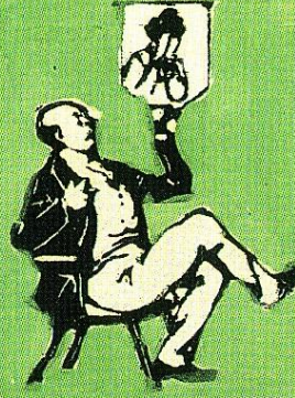
Proprietor of white Slaves