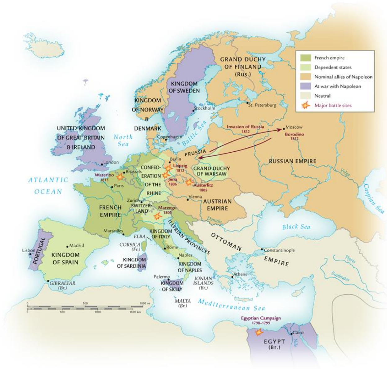
Napoleon's Empire in 1812