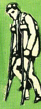
Unfit for Service